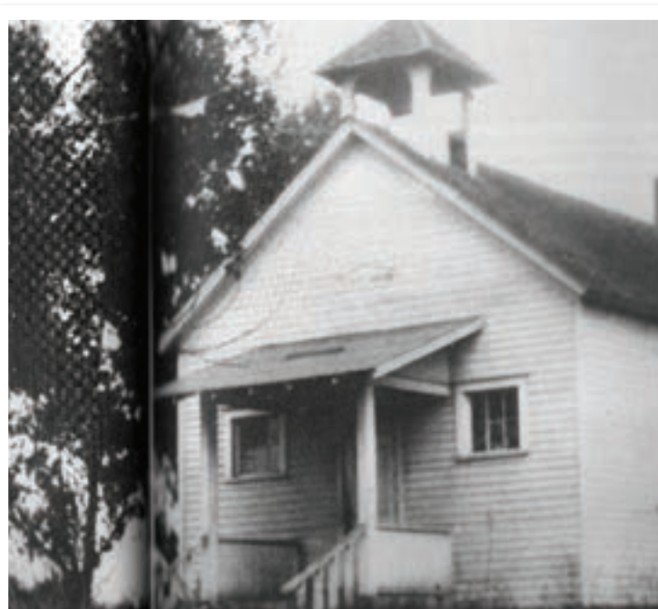
The Bennett School became part of a residence on the north side of Miller Road at Route 12.