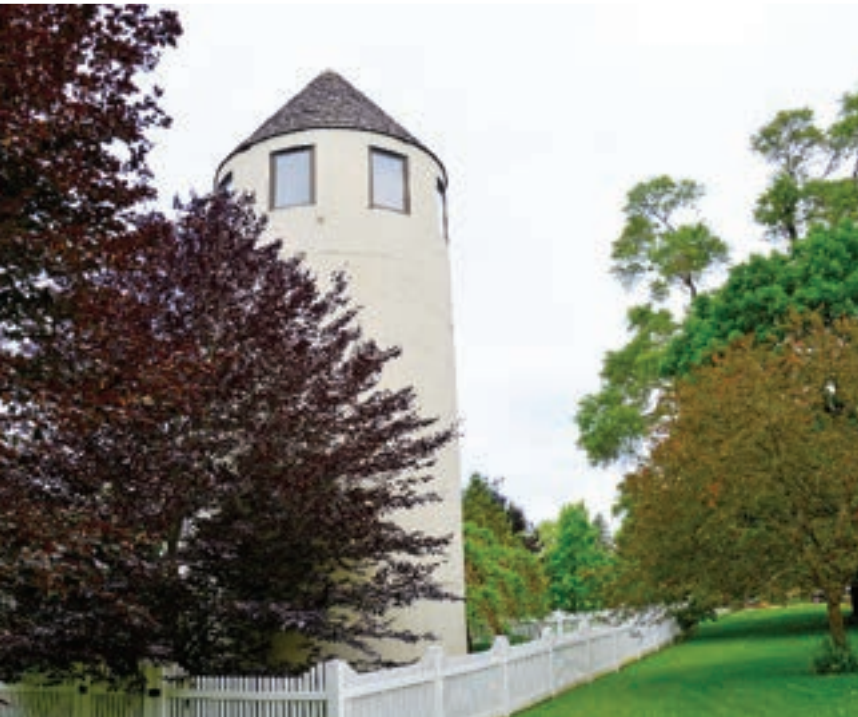
This silo was original to a home on Signal Hill Road that is no longer. In the garage of the home, with a vote of 108 to 28, the annexation to form North Barrington was passed in 1959.