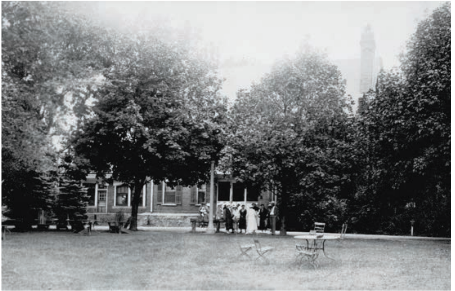
A gathering at the posh new Biltmore Country Club in the mid-to-late 1920s.

specially designed entrance to allow bus and car arrivals.