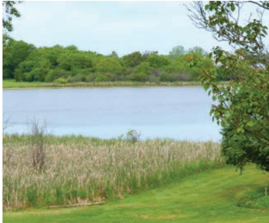
Grassy Lake is a 41.4-acre natural glacier-formed lake.