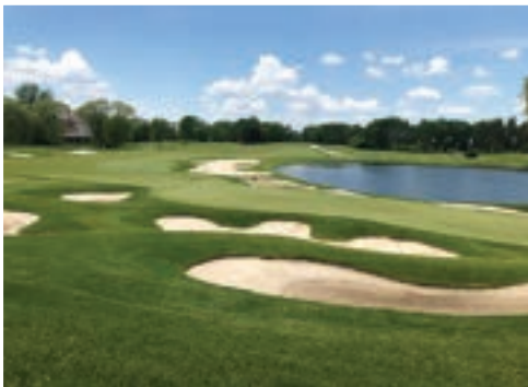
Wynstone Golf Club in North Barrington.

The Village of North Barrington is in the unique position of being the only municipality in the area that has two country clubs with Biltmore County Club and Wynstone within its boundaries, in addition to Old Barrington Farm, a 60-acre premier equestrian farm which resides in the Village of North Barrington.