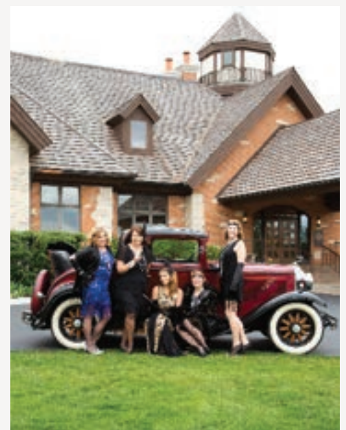
Quintessential Barrington covered Biltmore Country Club’s 90th anniversary celebration in 2016.

I knew that I wanted my future children to know, appreciate, and learn to love nature the way I did. I felt it was a safe place to raise kids with all the wonderful natural resources surrounding us. I was pleased that it offered the Barrington 220 School District, a national Blue-Ribbon School District. North Barrington residents are lucky with having the option of two great award-winning school districts with Barrington 220 and Lake Zurich 95. For our children they were lucky to have the benefit of the North Elementary School being so close to home.