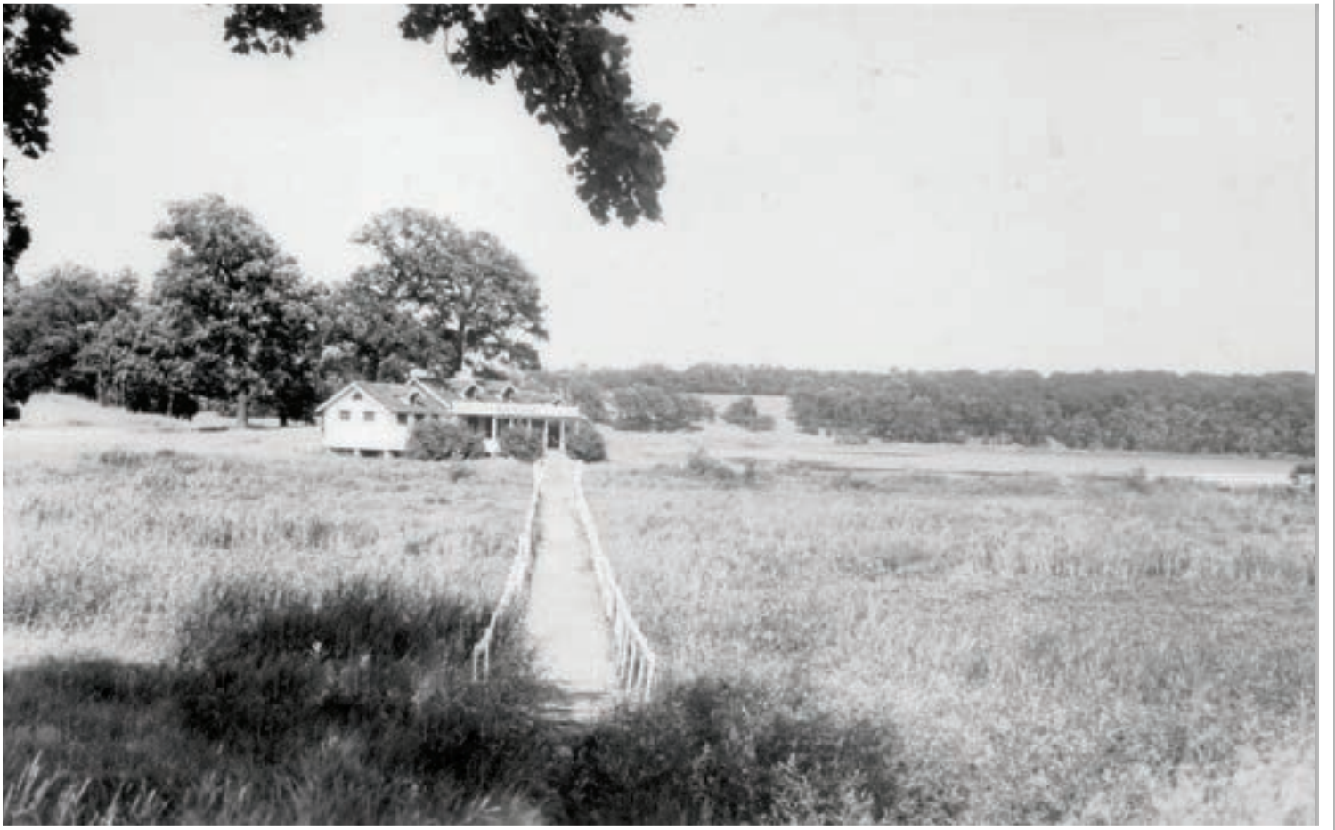
A walkway takes guests to the Biltmore Country Club bathhouse and beach (c. 1920s).